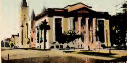
Carnegie Library and Presbyterian Church.